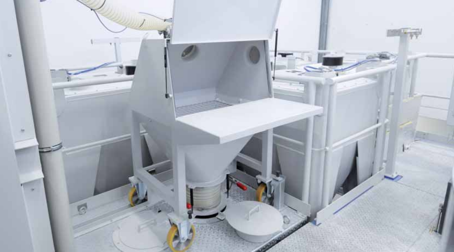
Mobile variation of sack chute type ST for adding dosages