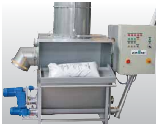
Emptying sacks with force feeder/steep screw conveyor