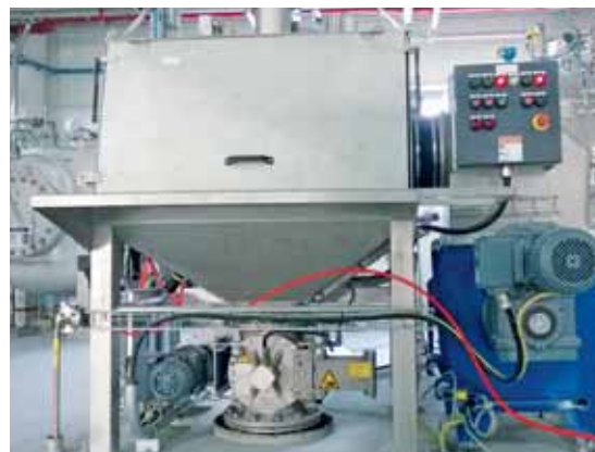
Sack chute with downstream rotary valve