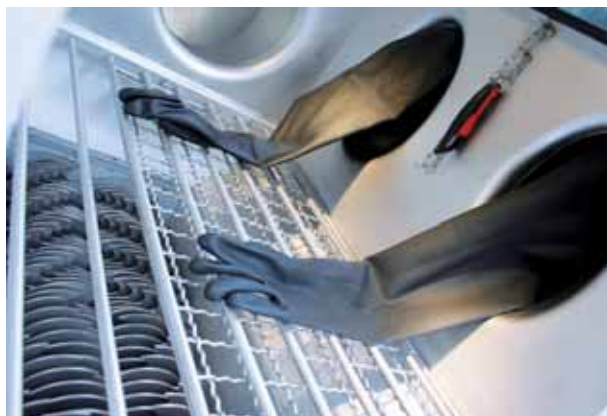
Sack discharge cabinet with downstream lump crusher