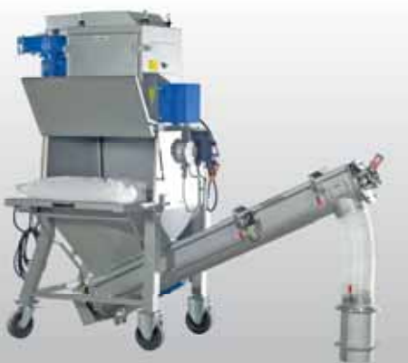
Sacks chute with filter reduced in height