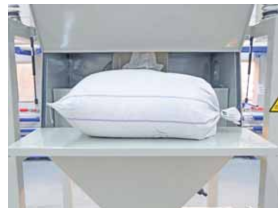
Optimum work surface for handling various containers