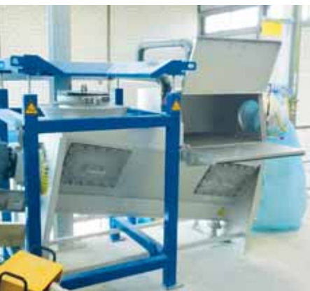
Combined sack/Big Bag Discharger