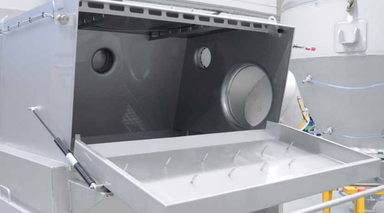
Sack discharge machine with gas spring supported discharge flap and holding spikes to fix sacks