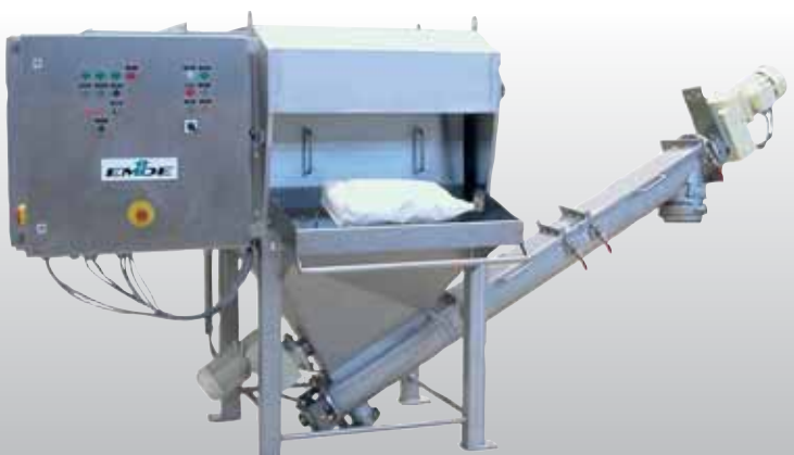
Sack emptying device with depositing screw