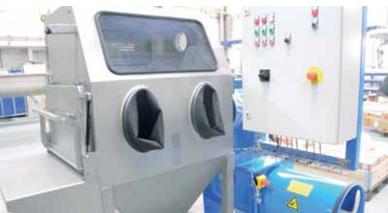
Feeding door with tightly closing flap