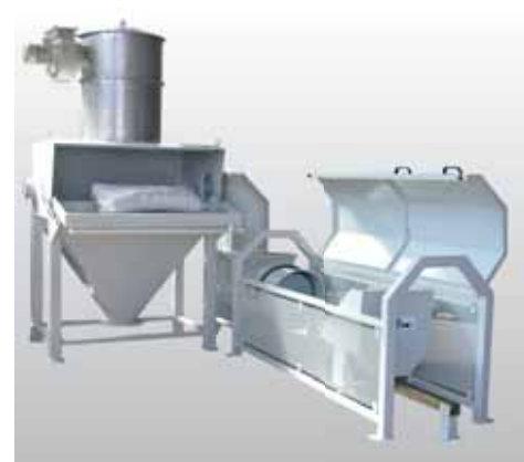
Sack discharger with connected waste bag compactor