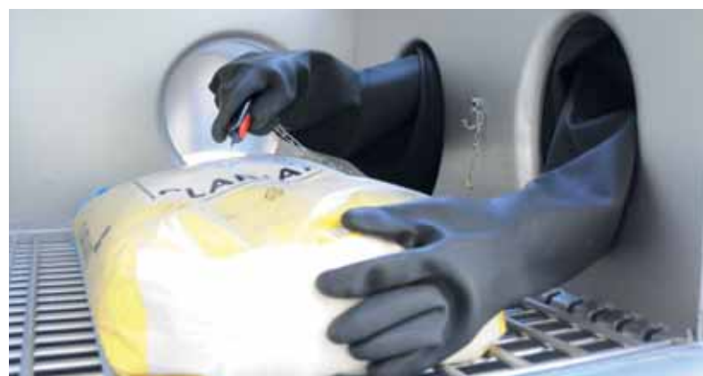
Sack handling with gauntlet glove and safety knife