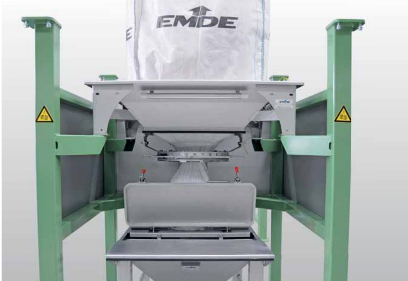
Combined sack/Big Bag discharger with iris collar clasp for resealing Big Bags