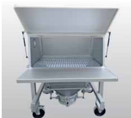
Optimum work space