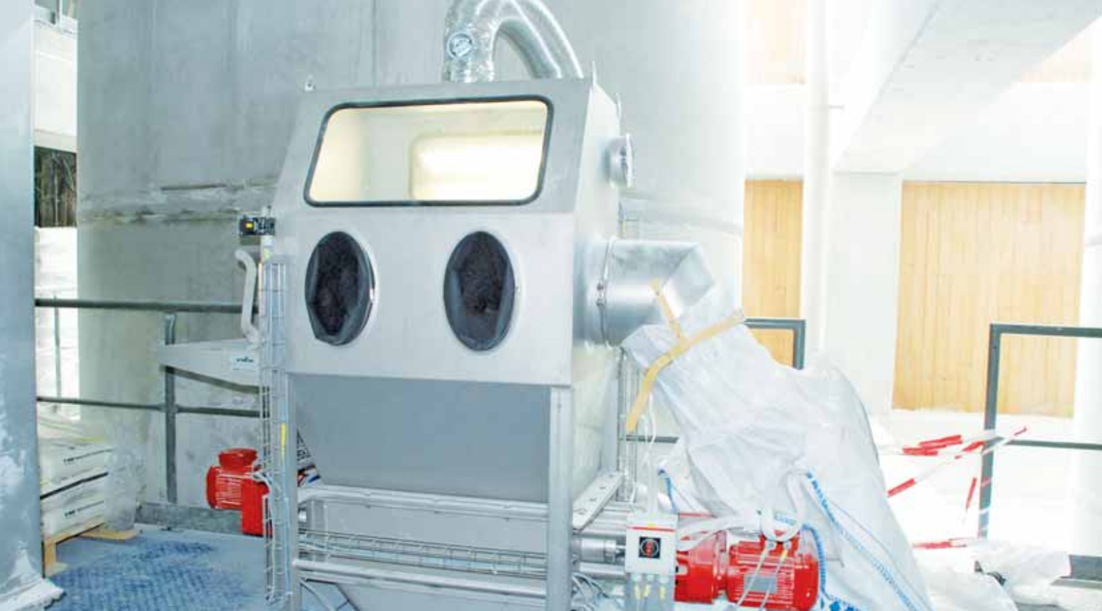
Sack discharge cabinet used in the salt industry