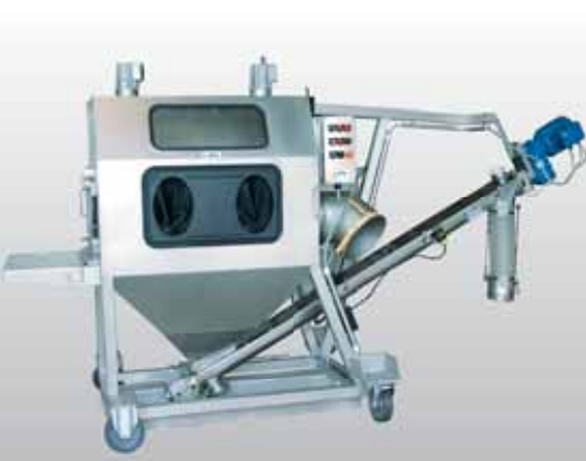
Mobile variation with discharge screw conveyor