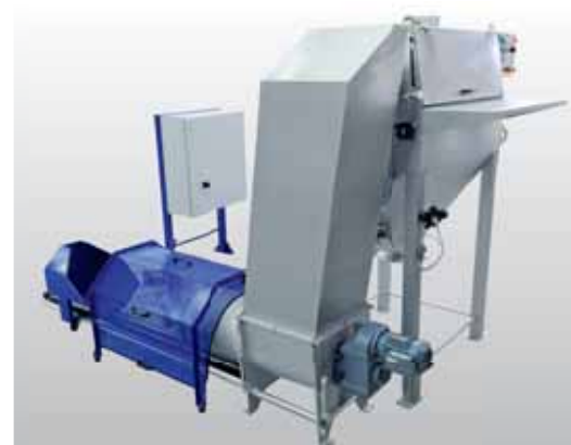
Empty sack compacter with large dropping chute