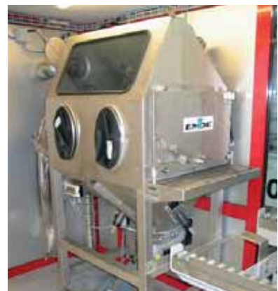
Sack discharge cabinet for handling soot