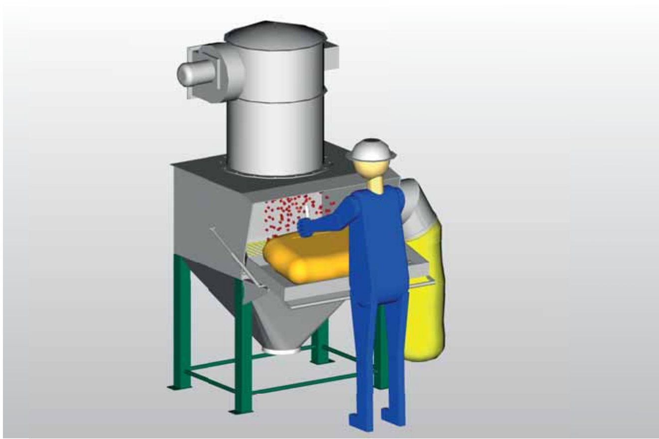
Sack emptying device type SE with filter and head for fixing empty sacks