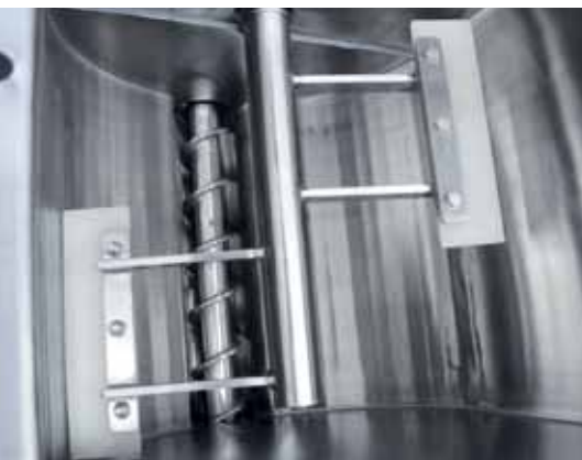
Dispersing agitator with exchangeable PU paddle