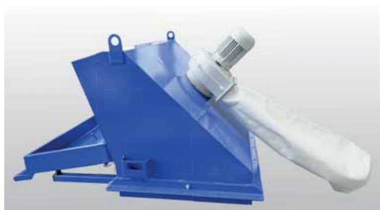
Sack discharge hood with ventilator and dust bag for fixing on containers