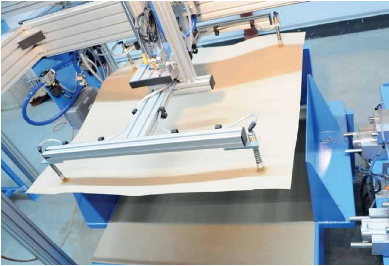
Paperboard sheet dispenser for moisture protection between pallet and Big Bag