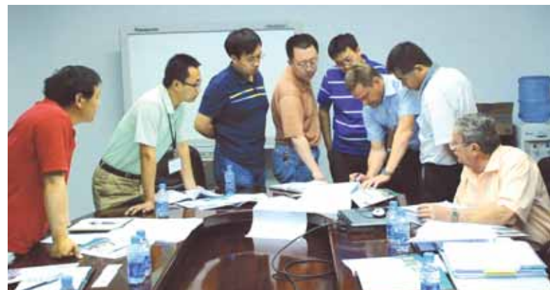
Project meeting in China