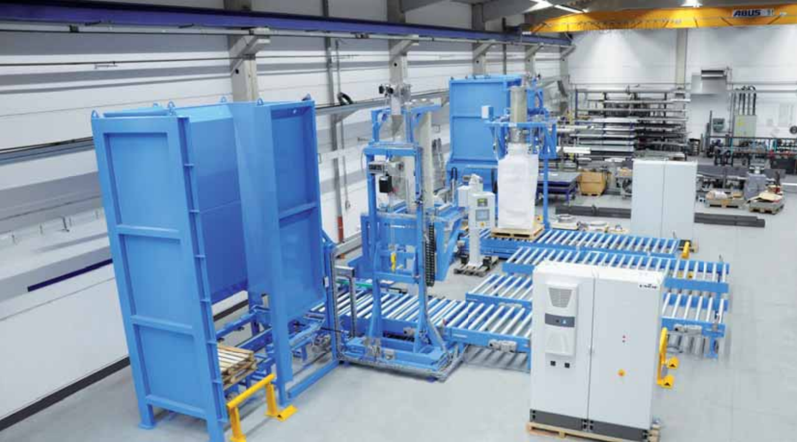
Dual filling system in final assembly for FAT test