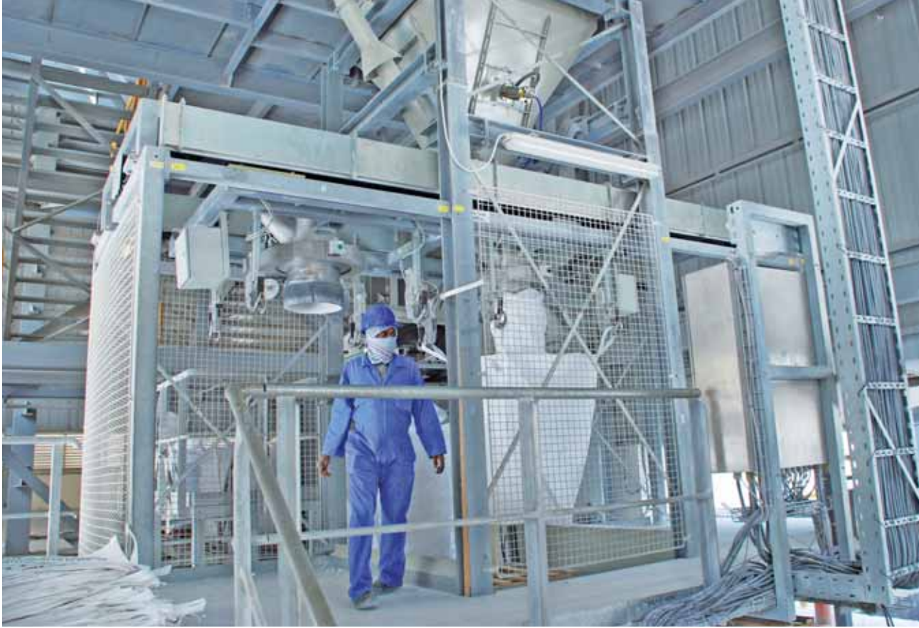
High performance filling system for up to 60 Big Bags per hour