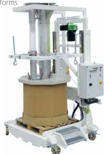
Combined Big Bag-/Octabin filling station