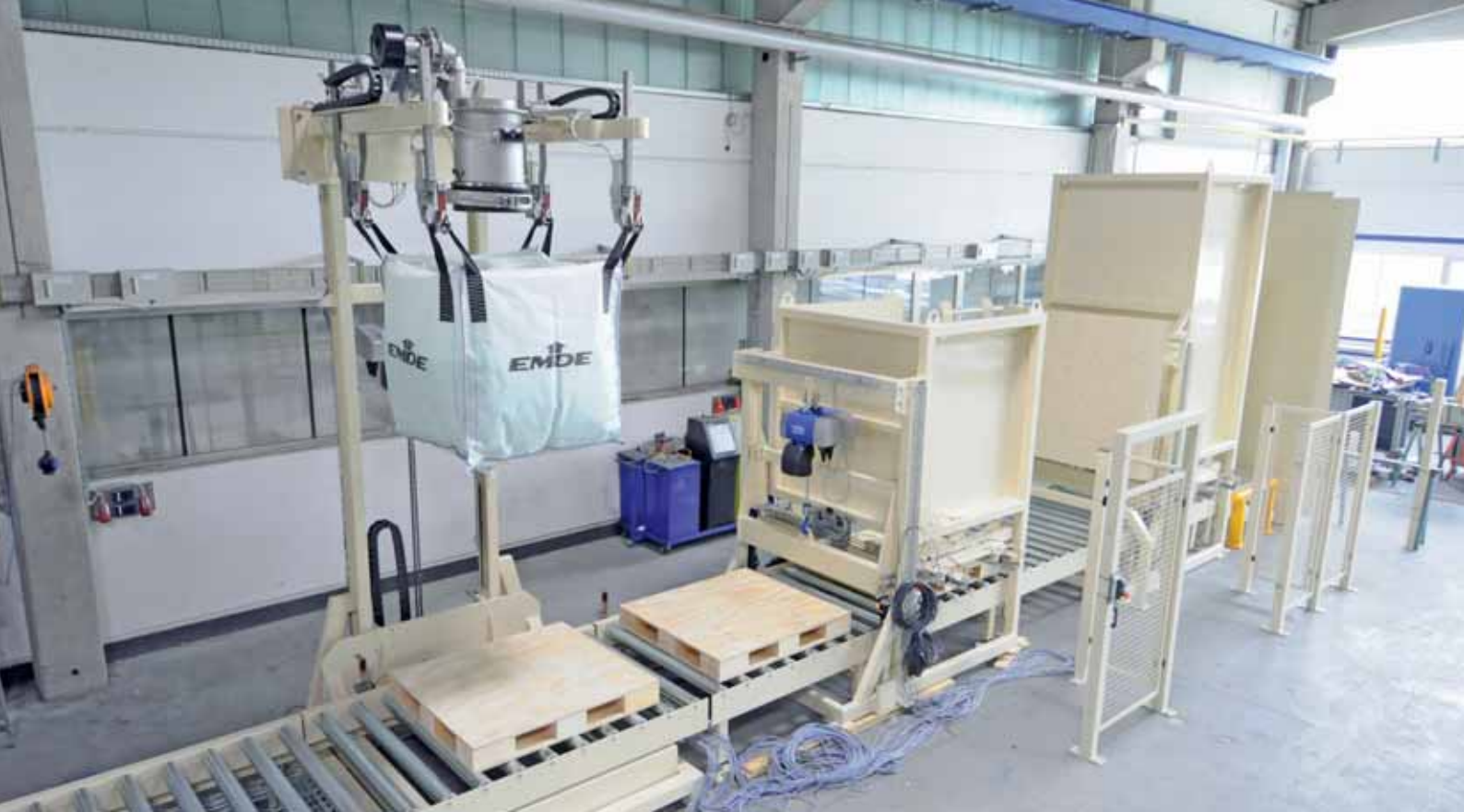
Big Bag filling system with release position for pallet stack and pallet magazine in final assembly