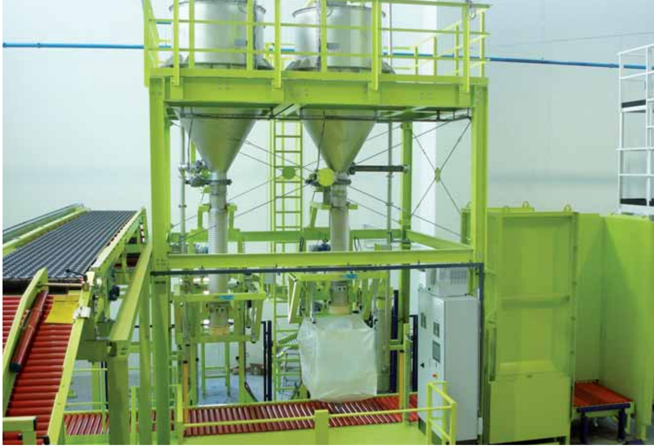
Dual Big Bag fillingsystem with pre-weighing