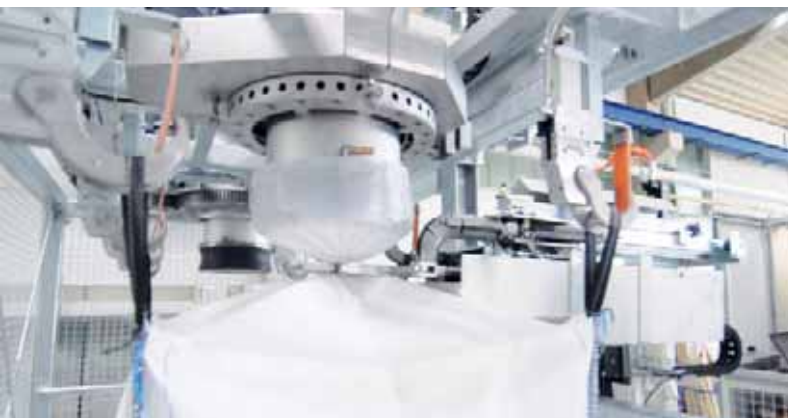
Automatic closing system with clip