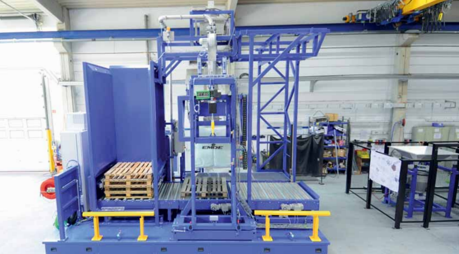
Compact rail moving filling system with pallet magazine for product filling underneath of silos