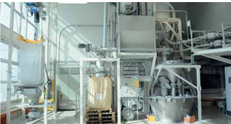
Volumetric filling station with maximum sensor in the filling