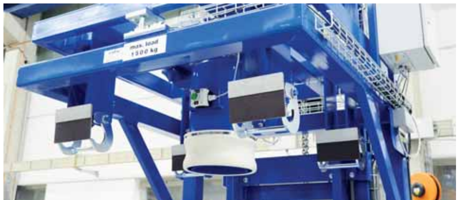
Swivel hook for Big Bag removal through fork lift prongs