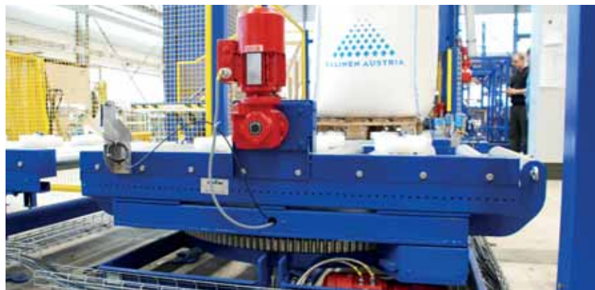
Pallet conveyor system with rotary table