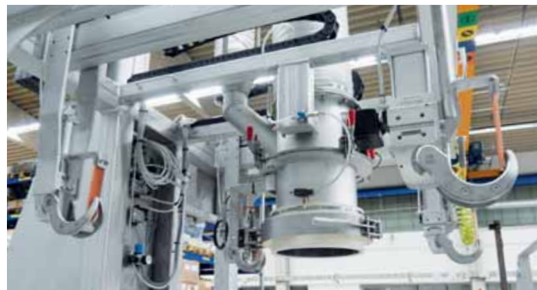
Movable rear hooks