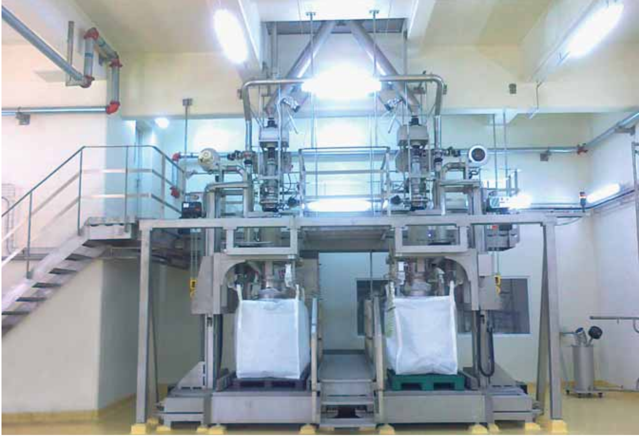
Dual filling system in the food industry