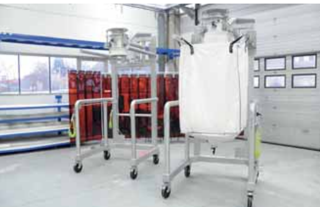
Mobile big Bag filling station with pipe forks