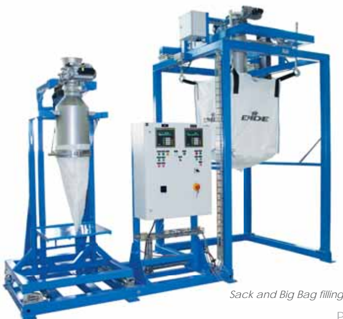
Sack and Big Bag filling